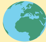
6 Years Old-12 Years Old