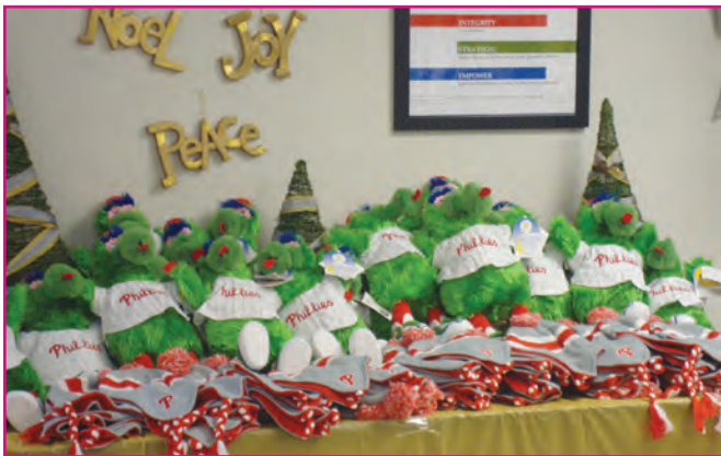
Staff members of the Phillies organization visit PEC each December to bring gifts and joy to our preschoolers. In addition, the Phillies front office 'adopts' a number of our families at the holidays, purchasing specific gifts for each member of the family from their 'wish list.'