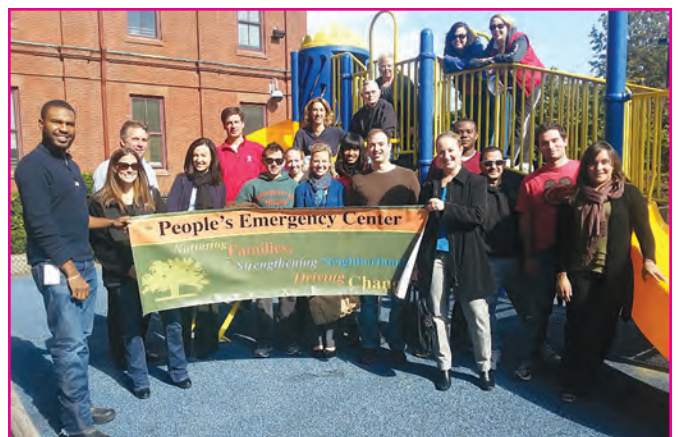
A group of 25 Entercom employees helped with various projects in October. The group pictured above gardened, painted, and helped Center for Employment and Training participants by reviewing resumes and holding mock interviews. Entercom is one of many companies who partner with PEC for teambuilding exercises with their employees during a Day of Service.