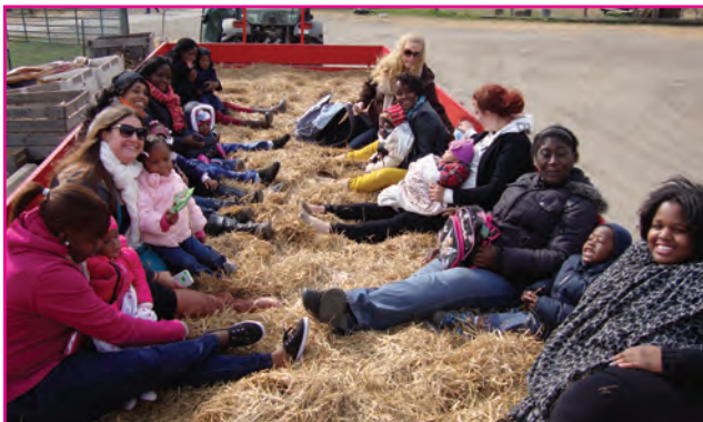
The staff, moms and children participating in PEC's Center for Parenting and Early Childhood Education (CPECE) enjoyed a fall field trip to Linvilla Orchards. CPECE staff works with PEC residents to strengthen family bonds and develop healthy, cohesive family relationships.

The Joseph and Marie Field Fund Duane Morris, LLP* Oak Foundation USA The Pew Charitable Trusts Philadelphia Housing Authority* Philadelphia Office of Housing and Community Development* The Reinvestment Fund* Stoneleigh Foundation Urban Affairs Coalition* Wyss Charitable Endowment