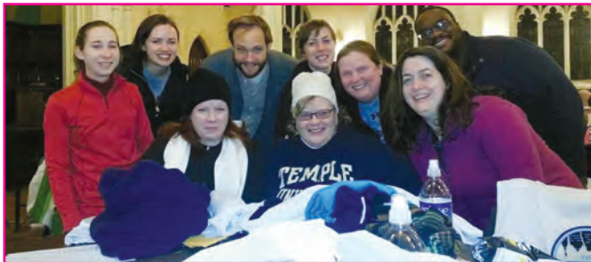
During the City's Code Blue warning, a group of PEC staff and volunteers joined together and braved the cold to participate in the Point in Time Count. This effort, organized by several agencies working together to end homelessness in Philadelphia, helps the city to better understand the prevalence of street homelessness, and gives a face to homelessness in Philadelphia.