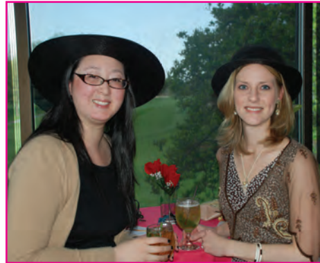
May 2014 Kentucky Derby party fundraising event featured fancy hats, mint juleps, and a fun atmosphere – all in support of PEC.