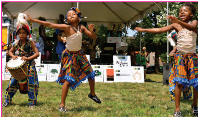
Each July, the Lancaster Avenue Jazz and Arts Festival fills Saunders Park, adjacent to PEC's Rowan House. In addition to a headliner and Philadelphia area Jazz groups, community groups are always a part of the mix. Pictured above are members of Universal Dance and Drum Ensemble.